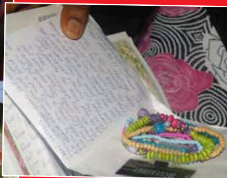
Cards of encouragement being received by the widow of a prisoner of faith who died in prison.