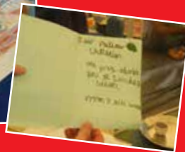
A card of encouragement to an Eritrean Christian in a refugee camp.

'IT IS SUCH A PRIVILEGE TO SEND ON THESE LETTERS AND CARDS OF ENCOURAGEMENT TO PRISONERS AND THEIR FAMILIES BECAUSE THEY ARE SENT WITH THE LOVE AND PRAYERS OF SO MANY CHRISTIANS HERE IN THE UK AND IRELAND.' Release's Prisoners of Faith manager