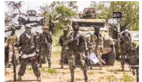
Boko Haram is one of the militant forces pushing for Nigeria to become an Islamic state

'Kidnapping for ransom has now become the major money earner for the terrorist groups while victims of rape and people living with disabilities due to the attacks continue to grow among the Christian communities. Hundreds of thousands of children in these Christian villages are either unable to go to school or cannot access any good education,' said our partner.