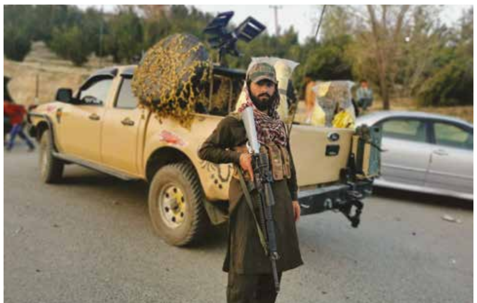
The presence of the Taliban has caused many to flee Afghanistan

Our partner said: 'Release's financial and prayer support is part of the reason why our ministry is able to continue and develop. The level of suffering in the region is huge... yet in the midst of it all, our ministry is flourishing — and seeing an increase in responses. This has to be answered prayer. Thank you for your support and prayers, especially for the vulnerable seekers and believers we minister to.'