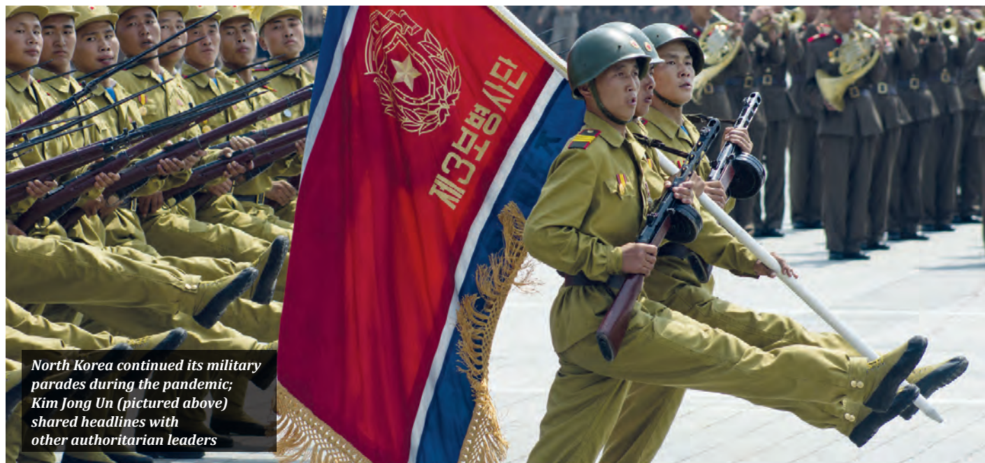
North Korea continued its military parades during the pandemic; Kim Jong Un (pictured above) shared headlines with other authoritarian leaders