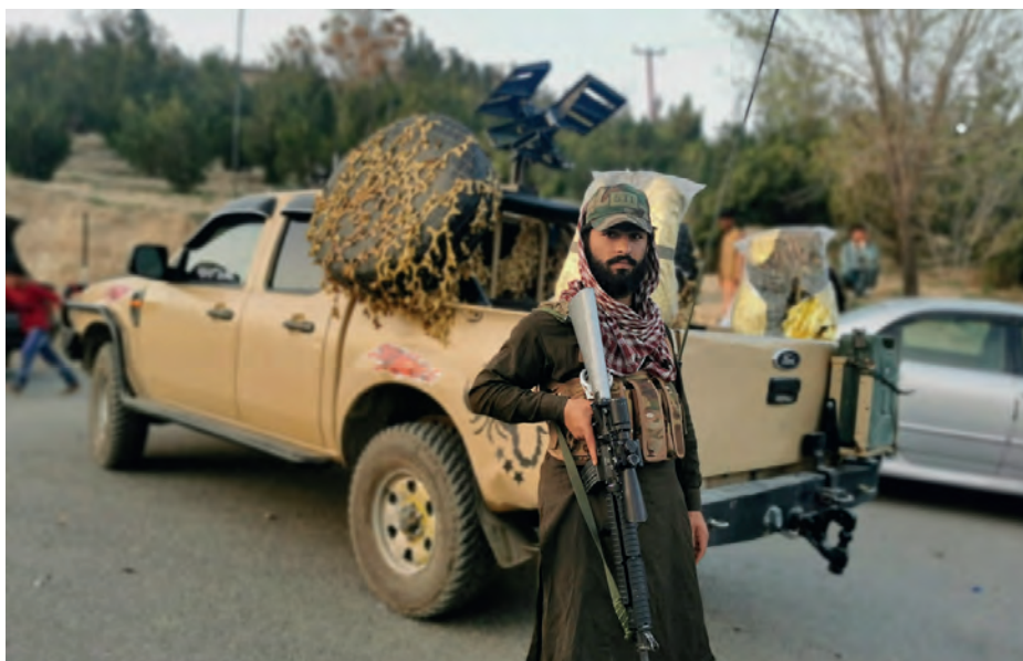
The presence of the Taliban has caused many to flee Afghanistan