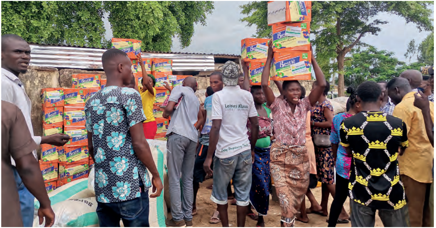
Release International partners provide aid for Christians displaced by the violence of militant groups such as Boko Haram

funded, encouraged and supported by various bodies both locally and internationally.