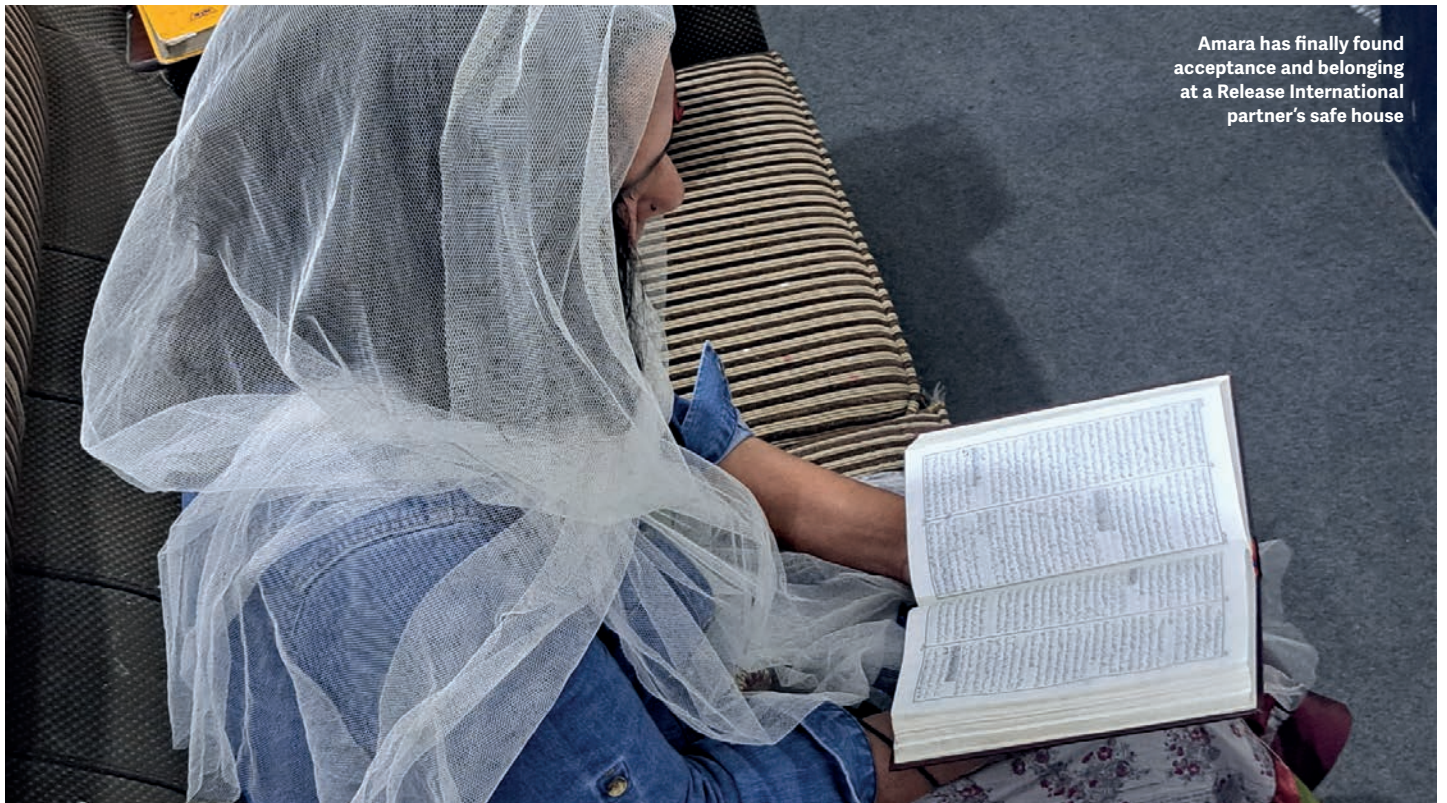
Amara has finally found acceptance and belonging at a Release International partner's safe house