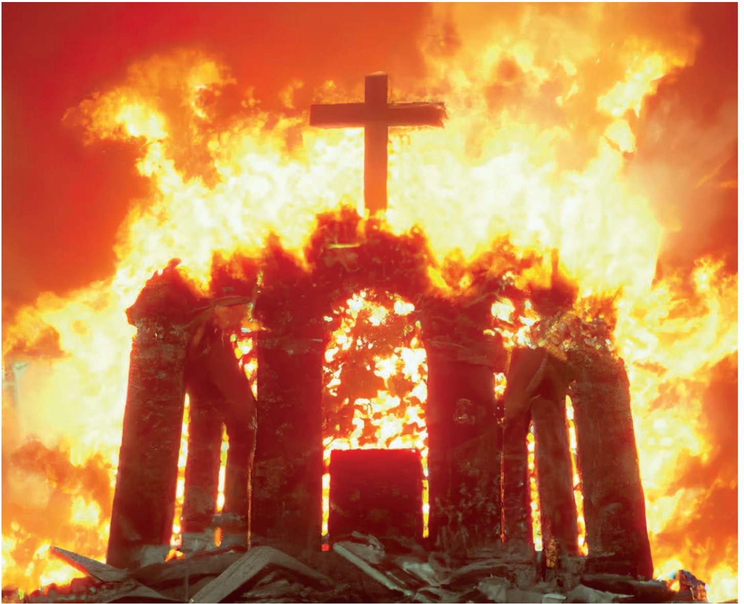
Peaceful co-existence between Muslims and Christians ended after the Jaranwala attack.

led me to many Scriptures including from the book of Job (chapter 2, verse 10) where it says, "Shall we accept good from God, and not trouble?"