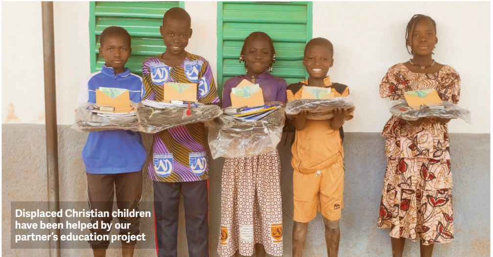
Displaced Christian children have been helped by our partner's education project