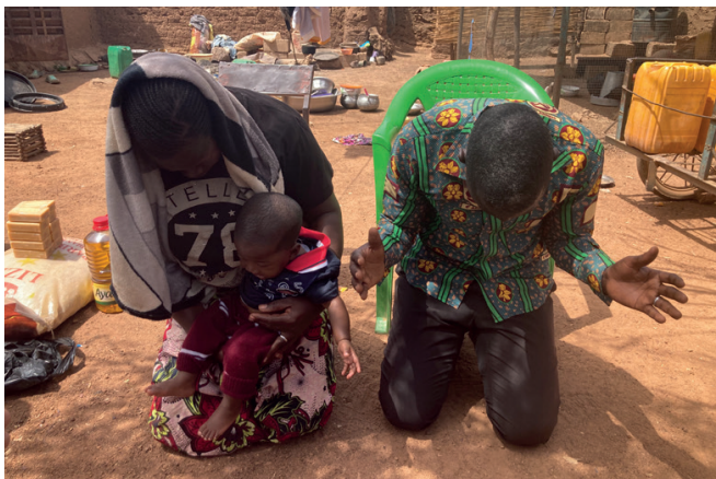
A Burkinabe pastor prays with his wife and child

FRIDAY 6: Pray that believers in Somalia would be blessed with access to Bibles, which