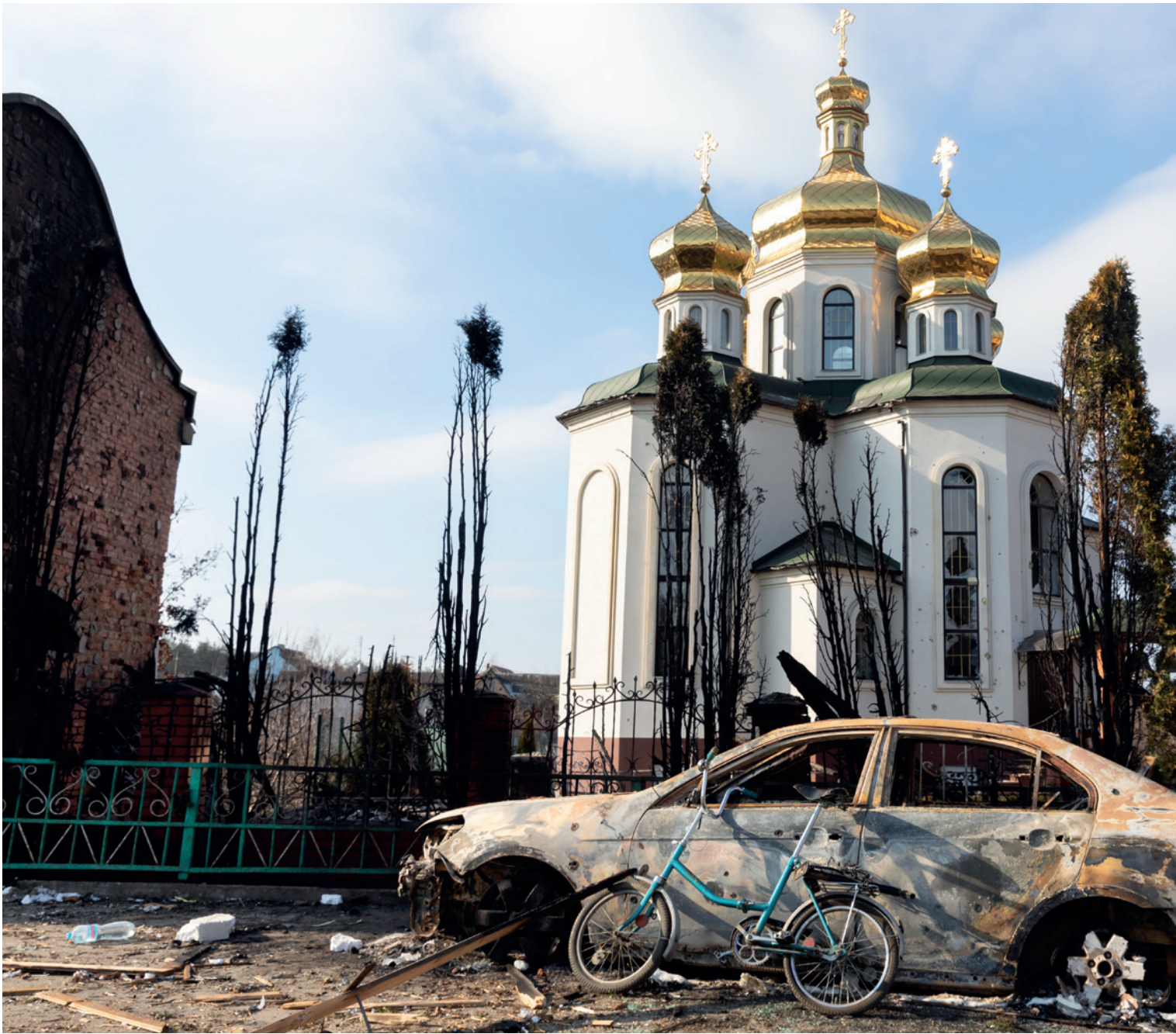
Some pastors and churches have had to evacuate from the frontline in Ukraine as the Russian army has advanced Stock image