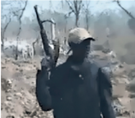
Militant Fulani herdsman are responsible for many Christian deaths

alongside government inaction and inadequate security responses.