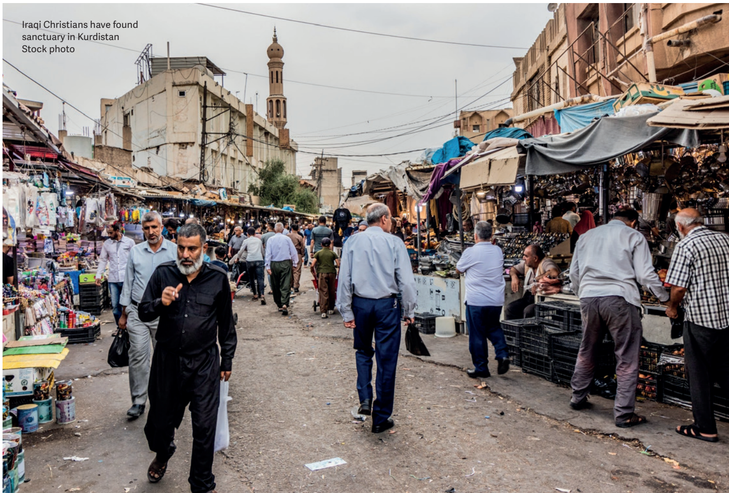
Iraqi Christians have found sanctuary in Kurdistan

(MBBs) fleeing violence, discrimination and threats from across Iraq and beyond.